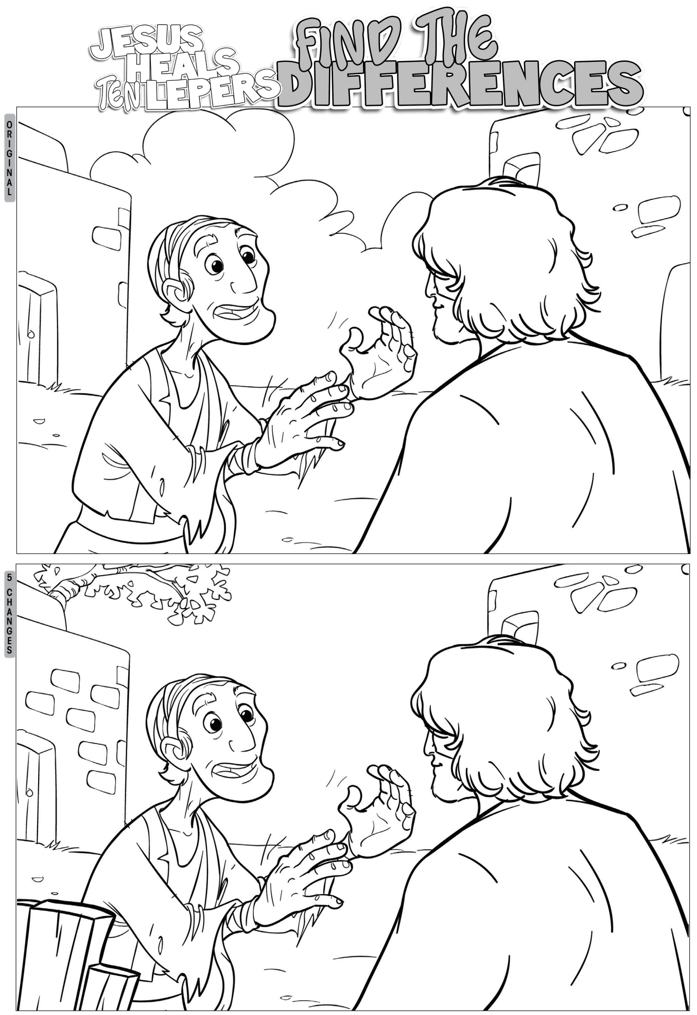
Copyright © Calvary Curriculum & Matt Baker