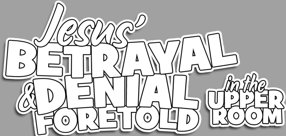
John 13:21-38 (Matthew 26:21-25; Mark 14:18-21; Luke 22:21-23)