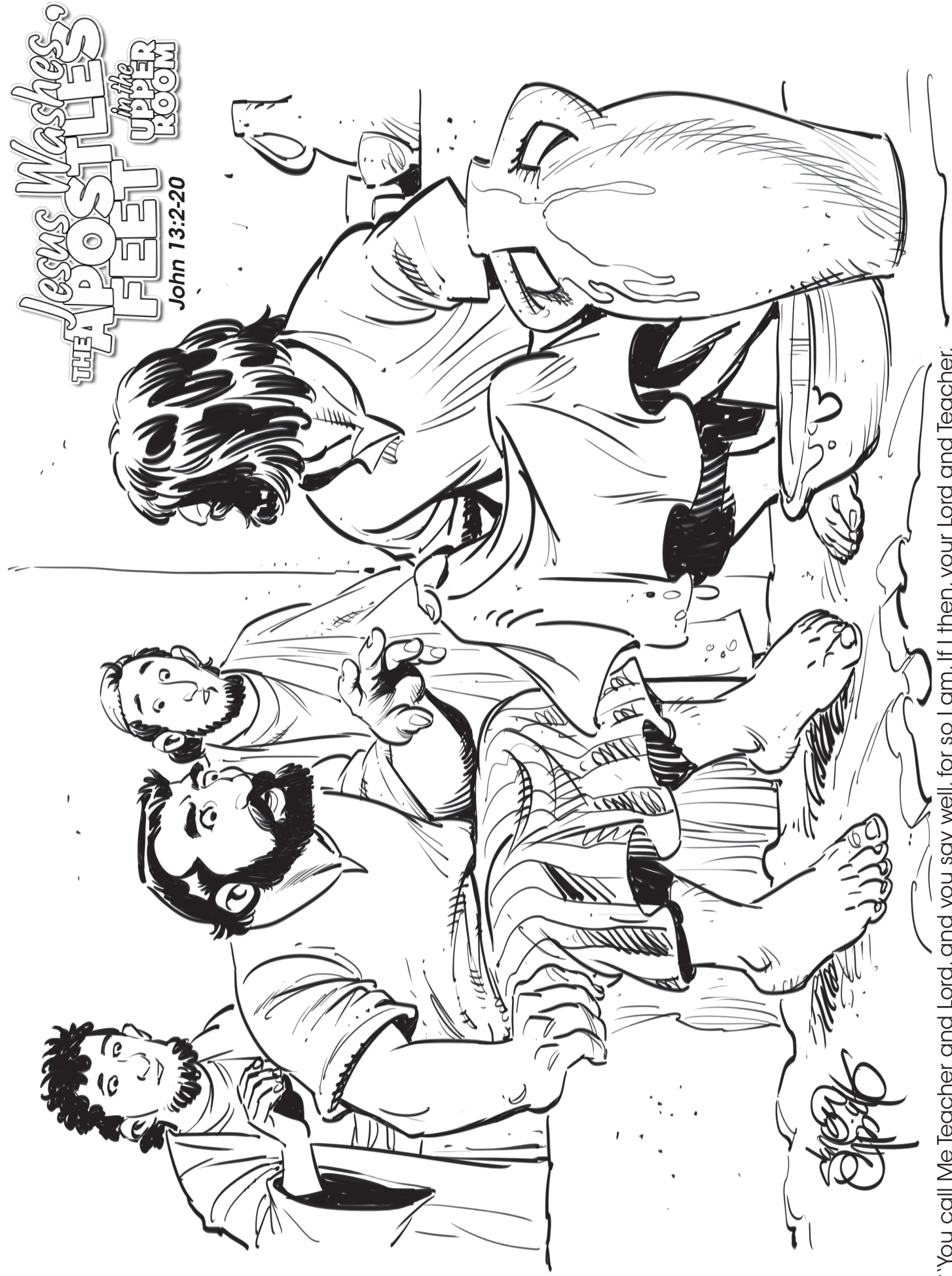
"'You call Me Teacher and Lord, and you say well, for so I am. If I then, your Lord and Teacher," have washed your feet, you also ought to wash one another's feet." John 13:13-14