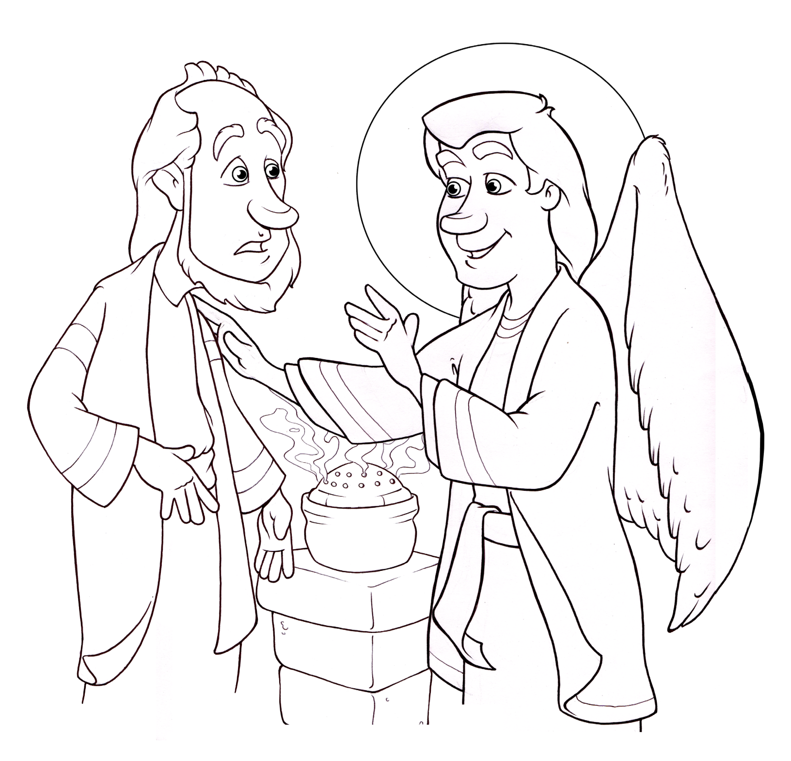
Jesus Loves _____ The Avgel of the Lord Appeared to Zacharias & John is Born Luke 1:5-25, 57-80

"And His mercy is on those who fear Him from generation to generation." Luke 1:50 Copyright © 2011 CalvaryCurriculum.com