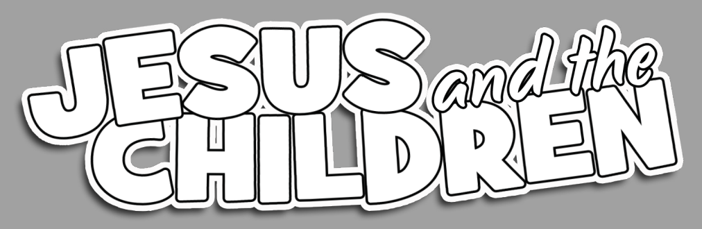
Mark 10:13-16 (Matthew 19:13-15, Luke 18:15-17)